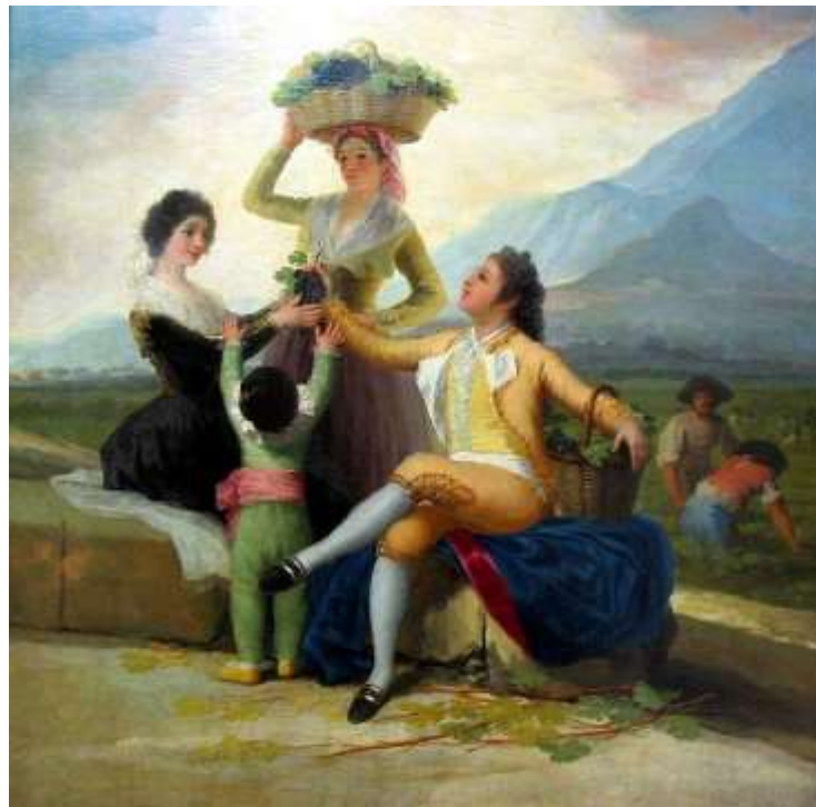
"Autumn, The Grape Harvest" Francisco Goya 1786. The landscape is pure Rioja: Goya was raised in nearby Zarázosa

Many wine lovers are beginning to rediscover the beauty of traditional Rioja, especially the older Reservas and Gran Reservas. Gran Reserva requires 24 months aging in barrel and a further 36 months in bottle before release, though many winemakers allow for additional aging in the bodega. No one is more traditional than Lopez-Heredia, Lopez-Heredia will not release their wines until they are considered ready, like the 1981 listed above, a current release. Pecina, Santurnia, La Rioja Alta and Marqués de Murrieta are also proud practitioners to one degree or another, of the traditional style. Emphasis is on finesse, delicacy and complexity; Really no other wines in the world are delivered to you with this much pampering at a comparable price