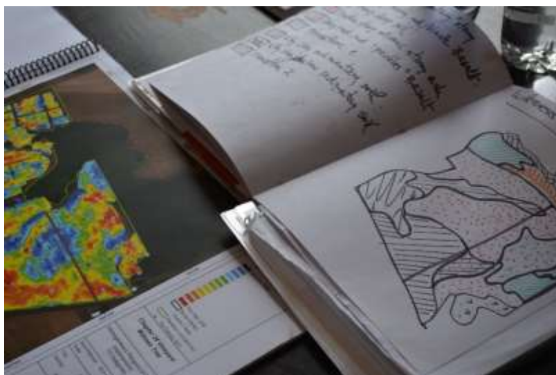
Chapter 24, Unique Pinot based on a rigorous analytic search for the best of Oregon's soils - structured, dense, detailed, earthy, mineral-laden,