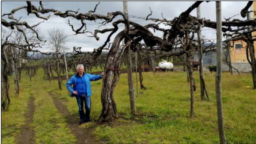
Old Aglianico vines in Taurasi, with ancient canopy vine training. Taurasi is known as 'The Barolo of the South' for good reason. Majestic wines!