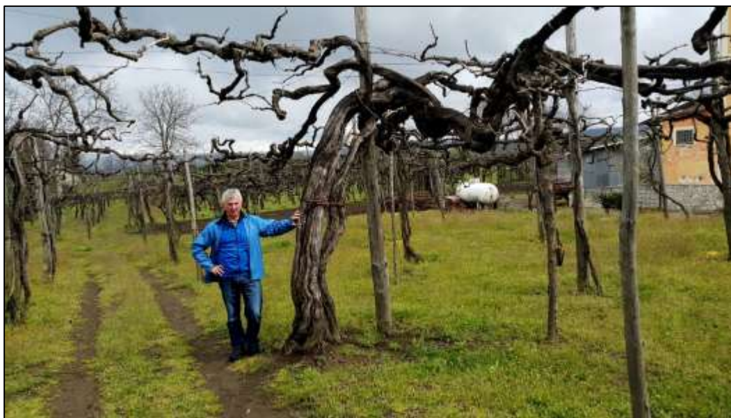
Old Aglianico vines in Taurasi, with ancient canopy vine training. Taurasi is known as 'The Barolo of the South' for good reason. Majestic wines!