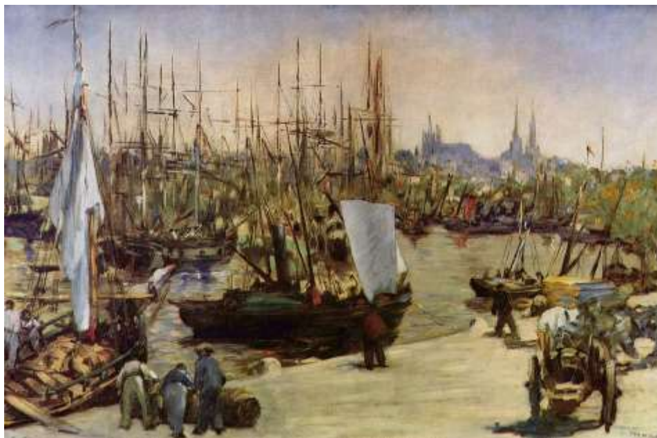
View of the port of Bordeaux, 19 th C., Edouard Manet. The Dutch, Germans, British, Irish all had important roles in both the shipping and creation of Bordeaux wines. This openness to international trade helped to make Bordeaux the benchmark wine of the 19 th and 20 th centuries. Today, China's thirst for Bordeaux, and their willingness to pay, has pushed the price of the top growths into the stratosphere

360 Château Pichon Longueville Comtesse de Lalande, Pauillac, 2006 | 250