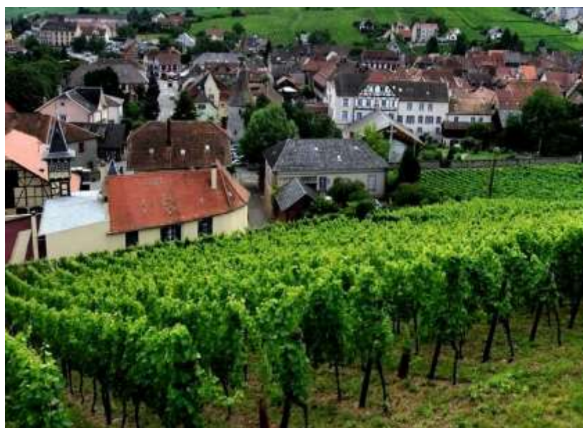
The Frédéric Emile vineyard, just above the Trimbach winery