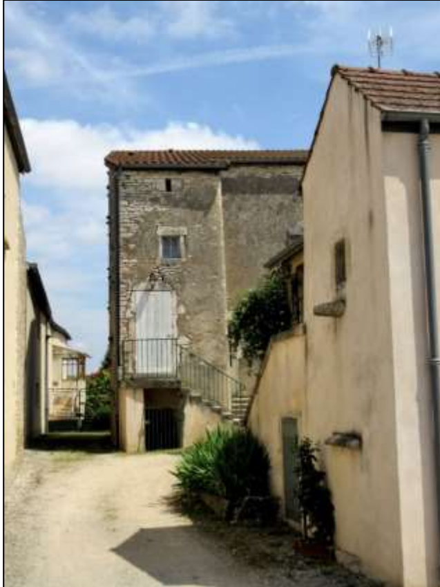
Typical view in the village of Chassagne