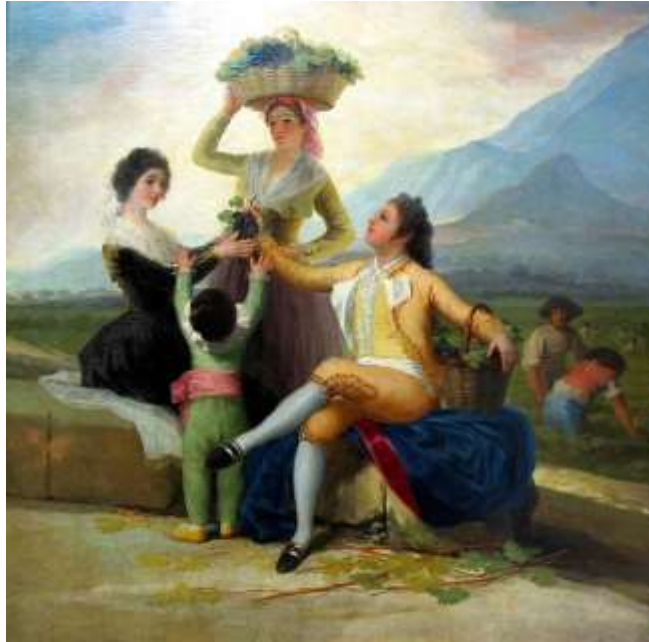
"Autumn, The Grape Harvest" Francisco Goya 1786. The landscape is pure Rioja; Goya was raised in nearby Zaragosa