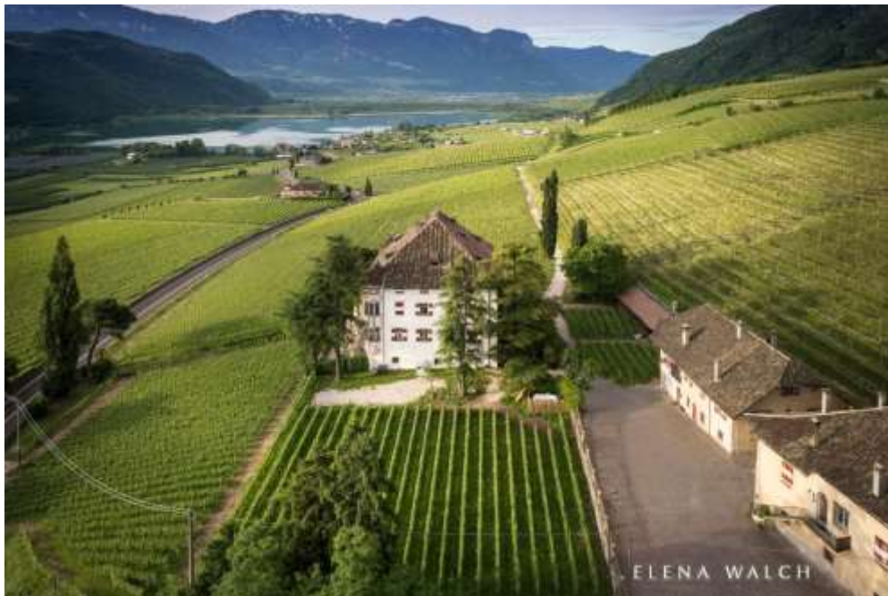
Südtirol Alto-Adige in the Italian Alps is home to distinctive and aromatic whites. This was Austrian land until the end of WW I, the Germanic influence in the wines is still pronounced.