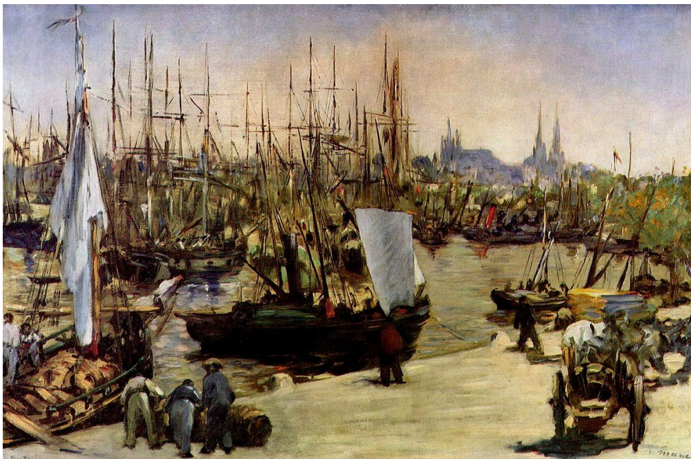
The Dutch, Germans, British, Irish all had important roles in both the shipping and creation of Bordeaux wines. This openness to international trade helped to make Bordeaux the benchmark wine of the 19 th and 20 th centuries. Today, China's thirst for Bordeaux, and their willingness to pay, has pushed the price of the top growths into the stratosphere. View of the port of Bordeaux, Edouard Manet, 1870s.