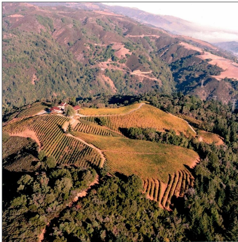
Aerial View of Domine Eden, sister estate of Mount Eden, high in the Santa Cruz Mountains. With a direct lineage to the pioneers of California wine, they are best known for their iconic Pinot and Chardonnay. The Cabernet also seems to evoke an earlier epoch; before people decided that bigger equals better: balanced, clean, elegant, mineral driven, beautiful aromatics.