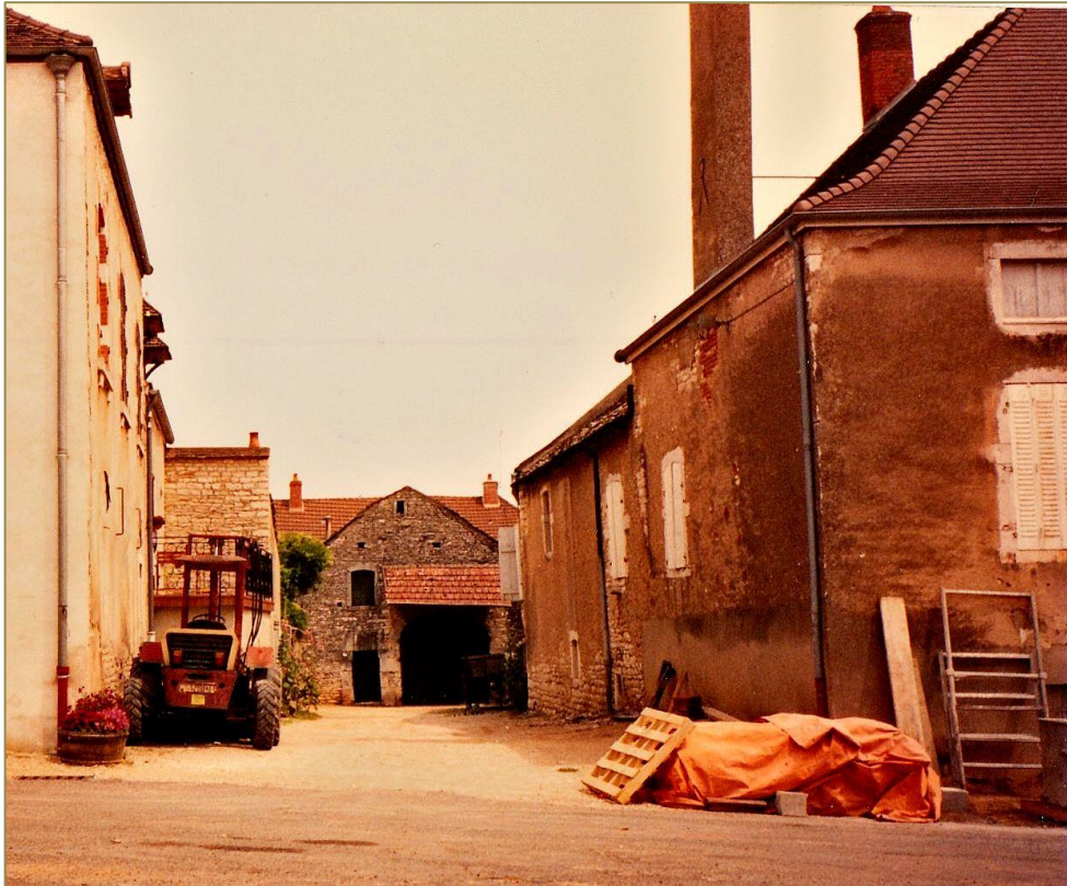
Typical view in the village of Chassagne, no different than hundreds of other sleepy French towns, except for the quality of its vineyards and the devotion of its farmers.