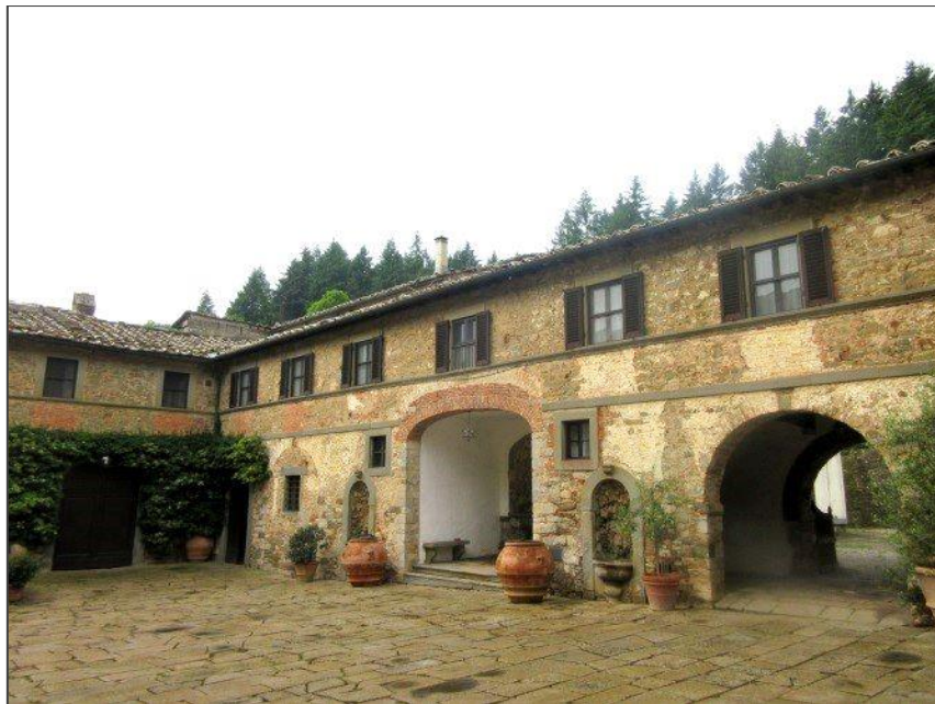
Badia a Coltibuono, home of soulful Chianti with unique personality