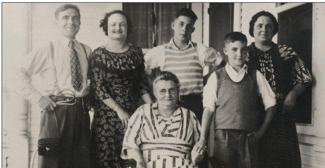
Seghesio 'Home Ranch', Sonoma Valley, California