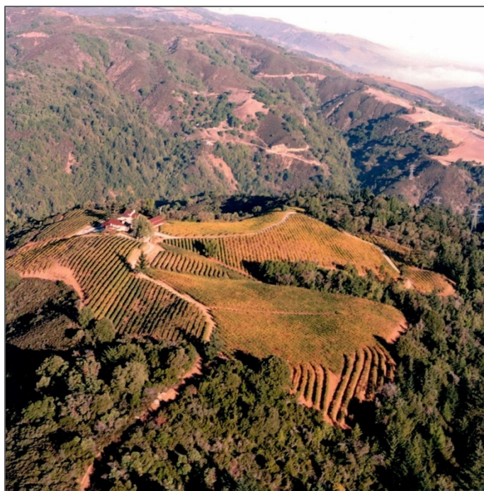
Aerial View of Domine Eden, sister estate of Mount Eden, high in the Santa Cruz Mountains With a direct lineage to the pioneers of California wine, they are best known for their iconic Pinot and Chardonnay. The Cabernet also seems to evoke an earlier epoch, before people decided that bigger equals better: balanced, clean, elegant, mineral driven, beautiful aromatics.